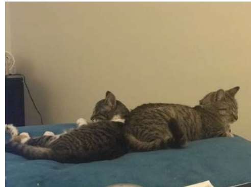
Sherlock and Wendell